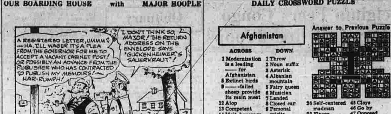
OUR BOARDING HOUSE