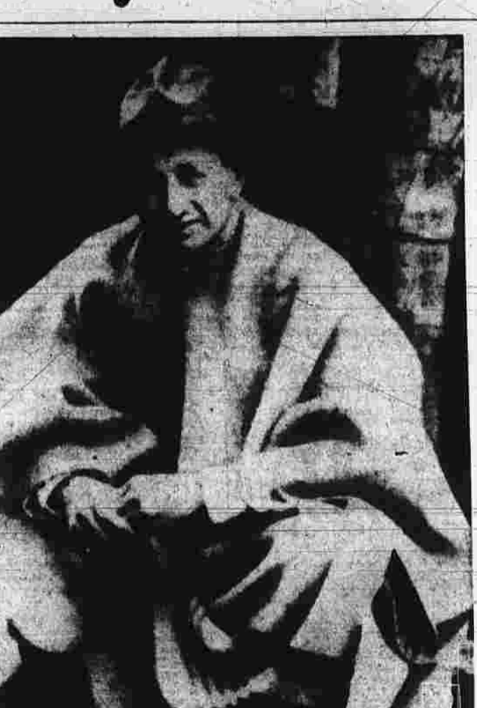
Rare Photo of Eichmann Former Nazi Col. Adolph Eichmann, now awaiting trial in Israel for mass murder of Jews during World War II, posed for this photo in 1955, while in hiding in South America. Taken at Port-Alegre, in southern Brazil, it is one of the few photos of Eichmann known to exist that were taken while he was in hiding.